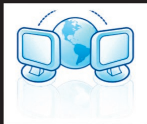
Network Trace & Management